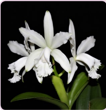
Cattleya intermedia var alba Grower: Christo Geringer