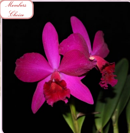
Cattleya Love Castle 'Kurenai'