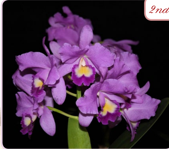
Cattlianthe Portia 'Etta Gray'