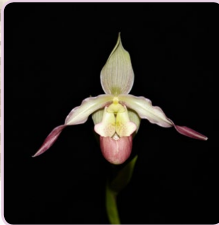
Phragmipedium Calurum Grower: Gregg Brill